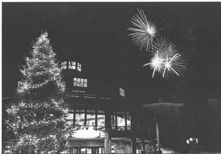
A look at Stowe's wonderful skiing opportunities during Christmas time