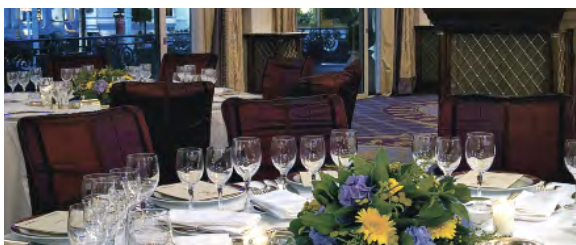
The Salle Empire dining room

The Salle Empire ( montecarlosbm.com/restaurants-in-monaco/gourmet/salle-empire ) at the gorgeous Hôtel de Paris ( hoteldeparismontecarlo.com ) has a lovely terrace overlooking the entrance to the grand casino. We experienced an extraordinary meal which lasted nearly two and a half hours.