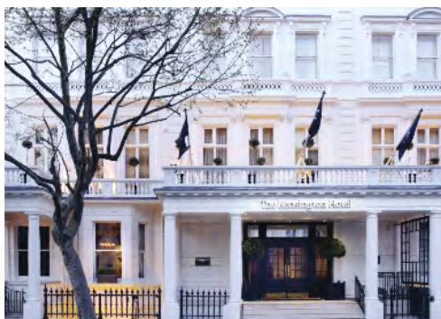
The Kensington Hotel

The Kensington Hotel ( doylecollection.com ) at the corner of Queen's Gate and Old Brompton Road, is part of the Doyle Collection, a privately owned group of eight luxury hotels located in the most fashionable neighbourhoods of five major cities around the world. The 150 room hotel is situated only a few blocks from the South Kensington tube station. We enjoyed a daily buffet breakfast in the main restaurant, Aubrey, and returned there twice for absolutely fabulous dinners. The hotel welcomes many Jewish guests. Upon request they are able to cater for any dietary requirements. There are more than 260,000 Jews residing in England and Wales.