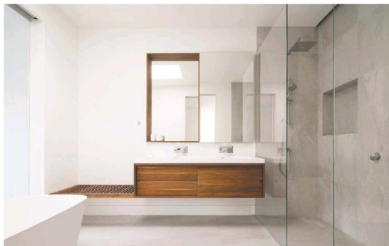
The upstairs bathroom. The Brick House also has a powder room, on the main floor.