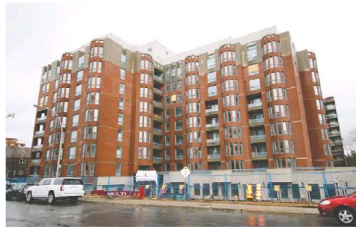
Le Montefiore's interior has been completely stripped and rebuilt; only the exterior of what was once the Manoir Montefiore remains the same.

All units come equipped with six stainless-steel appliances and rents include hot water. Parking