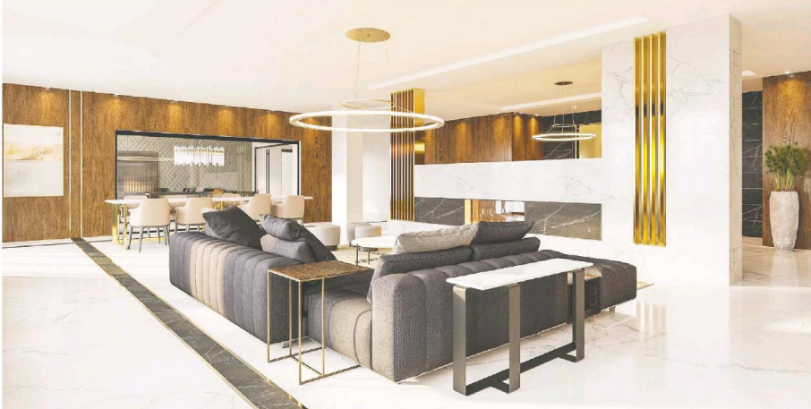
Le Montefiore's new lobby is beautiful and welcoming, says leasing agent Esther Cohen. "People can't believe it's the same place." ARTIST'S RENDERING COURTESY OF JADCO CONSTRUCTION