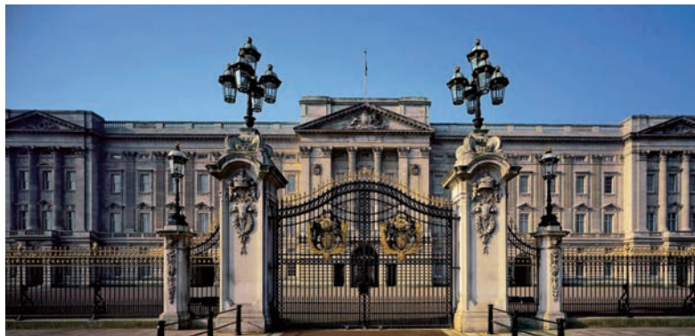
The historic gates of Buckingham Palace.

the Warner Brothers Studio Tour – the Harry Potter experience ( http://www.wbstudio-tour.co.uk ). Set adjacent to the working film studios where all eight Harry Potter films were made in the town of Leavesden, the studio tour offers vis-