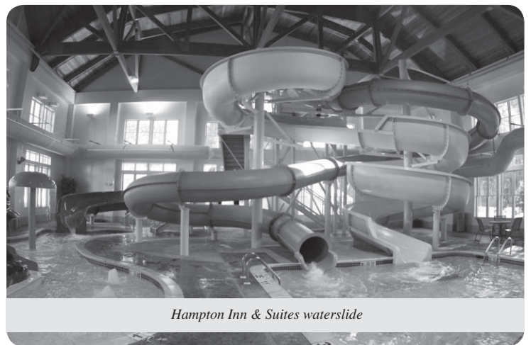
Hampton Inn & Suites waterslide