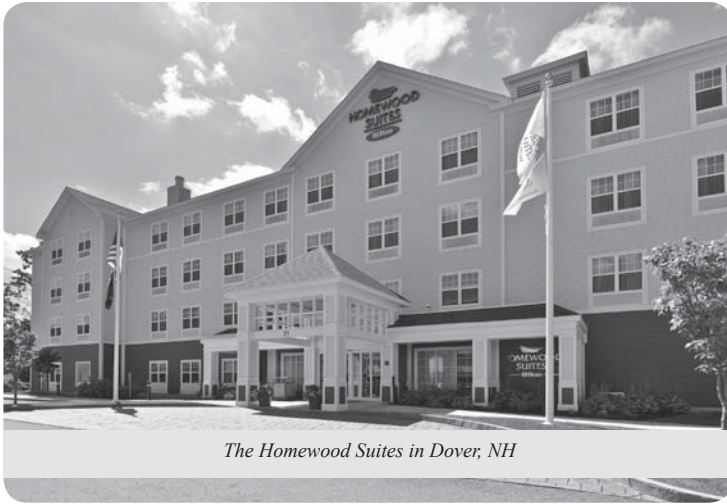
The Homewood Suites in Dover, NH

A number of large picnic areas are available for free at various points throughout the park so guests can eat without having to leave. Owned by Palace Entertainment, Water Country tests the limits on Double Geronimo or Thunder Falls and allows one to take a break in the relaxing Adventure River. There are over 26 acres of fun here. We went on a busy Sunday, opting for the preferred parking option ($15). This represented a very short walk to the front entrance. We rented a locker, which had plenty of room for the three of us to store all of our gear. The wait in line for different slides was not exceptionally long. Staff here are on the ball and take all safety precautions necessary.