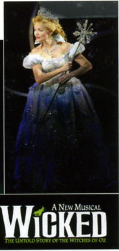
A NEW MUSICAL WICKED THE UNTOLD STORY OF THE WITCHES OF OZ

at no charge and may be secured from the house manager with a driver's license or major credit card. A schedule of performances that are interpreted for the people who are Deaf or Hard of Hearing is also available by calling the aforementioned number.