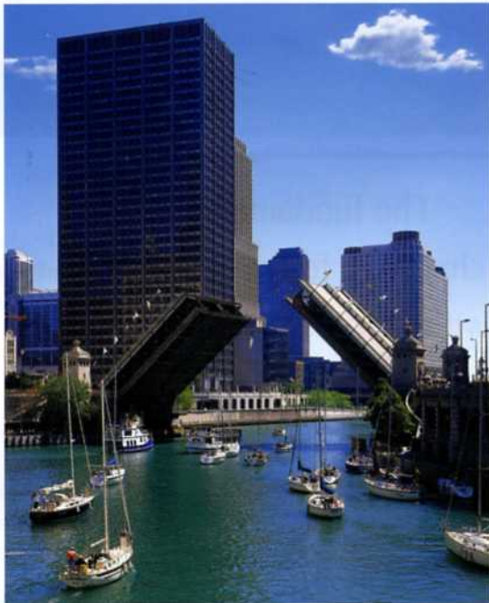
Michigan Avenue Bridge

Chicago is a bustling, energetic city that never stops no matter the season. It's a destination with world-class cultural attractions, diverse neighborhoods and architectural wonders ( www.choosechicago.com ). Chicago is known for critically-acclaimed restaurants, world-famous museums, first-class shopping, adventurous nightlife, action-packed sporting events and a thriving theater scene – all of which can be enjoyed by visitors with special needs thanks to a facilitative website created with exceptional travelers in mind.